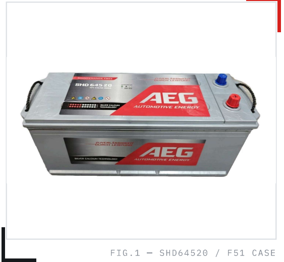
FIG.1 – SHD64520 / F51 CASE